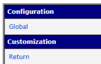
Figure 1: Main menu

Left part of this GUI contains menu with Configuration menu section. Customization menu section contains only the Return item, which switches back from the module's web page to the router's web configuration pages. The main menu of module's GUI is shown on Figure 1.